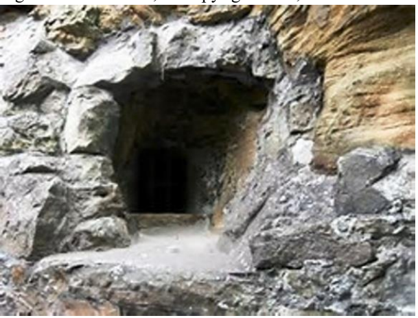
Fig 3. St Serf's Cave 10

The earliest documentary record of the cave at Dysart comes from the Vita Sancti Servani composed in the thirteenth century. According to the Vita , the cave was regularly used by Serf as a hermitage (a quiet spot intended for meditation). The vita includes one miracle that took place in the cave (changing water into wine), and a theological battle of wits between Serf and the Devil. The cave contains three natural chambers, into which benches have been carved, while steps and an ashlar door and a window between two