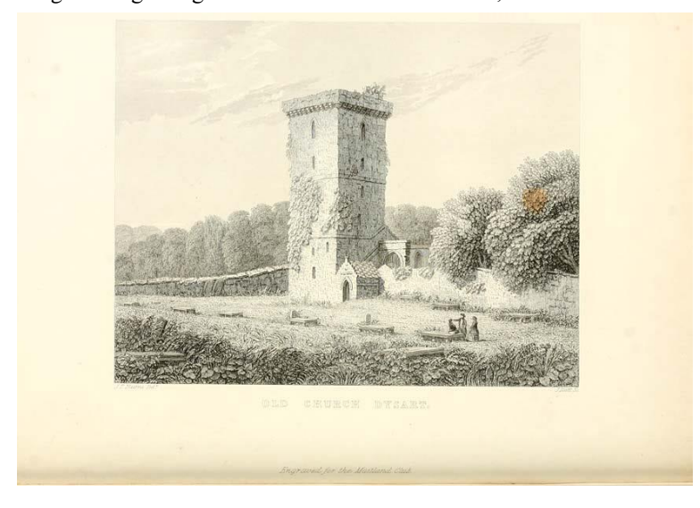
Fig 10. Engraving of the Old Church of St Serf's, 1853.75

The old parish church of St Serf's was abandoned following the construction of the Barony Church and its roof was removed and sold. The north aisle was demolished in 1805 to make way for a wagonway taking coal from the Engine Pit to the harbour. Shortly after this, the Sinclair burial aisle (formerly the south chancel aisle) reconstructed and provided with a new roof so that it might be used as a mausoleum for the family of the earl of Rosslyn. Repairs were