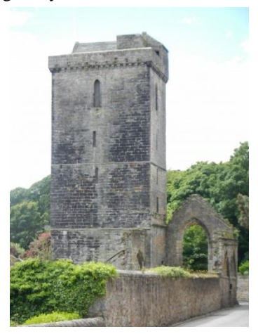
Fig 5. Dysart Old Parish Church, exterior from north east, @ R. Fawcett.<sup>27</sup>

This embellishment of the church was partly a result of the medieval development of the doctrine of purgatory. This was the idea that most people did not proceed directly to heaven when they died, but spent time in an unpleasant waiting area. Receiving official sanction from the Fourth Lateran Council in 1215, it was believed that to lessen the time your soul spent in purgatory it was important to lead a good life, to die well, and to secure prayers and masses for your soul after death. The most effective form of such prayers by the later Middle Ages were those performed by priests at chapels and altars dedicated to saints, who would be expected to intercede with God on your