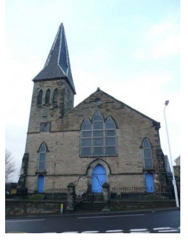
Fig. 11. United Presbyterian Church, Normand Road (Dec. 2007).80

The Relief Church was one of the two dissenting chapels in the parish noted by David Murray, the minister of the new Barony Church in 1845. He estimated they had a combined congregation of 800-900. The congregation joined the United Presbyterian Church in 1847 and the 1851 census recorded 285 attendees at the morning service and 336 in the afternoon. By 1867, they had outgrown the Auld House and moved to a new church on Normand road at a cost of £2600. The old building was sold and turned into a handloom factory. The new church could hold 650 people, and