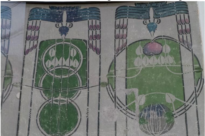
Fig 13. Mackintosh Mural – Image credit Elisabeth Viguie-Culshaw.<sup>94</sup>