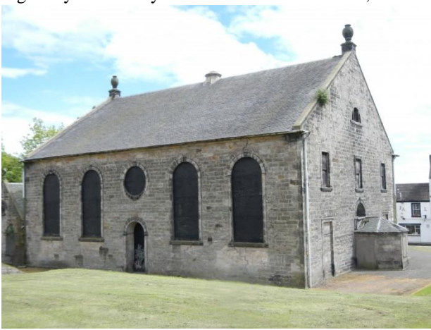
Fig 9. Dysart Barony Church @Richard Fawcett, 2012.<sup>71</sup>

In 1802-03, the congregation moved a new parish church in an event known locally as the year of the big flittin .<sup>72</sup> Known as the Barony Church and capable of sitting 1600 people, it was located to the north of the old parish at the top of the town. Designed by Alexander Laing, David Murray described it as a neat plain building in 1845, by which point the congregation was around 1200. This had risen slightly by 1851 when it was recorded that 1088 attended the morning service, and 1140 the afternoon service.<sup>73</sup> A